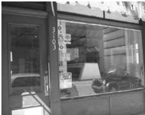
Above: The Brereton Street side of the building has two storefronts, as does the Dobson Street side (pictured below). There are potentially four rental units on top.