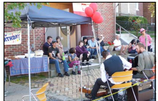
The steps to the PHCA office were a natural spot to watch the performance.