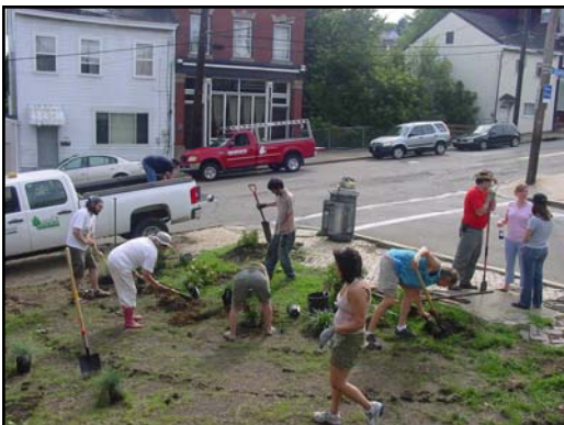
Polish Hill Green Team members planted butterfly bushes, roses, decorative grasses and perennials.

Somewhere along the way, I humbly submitted a name for the park via Blogski. I had been talking with my father about the word "little" in Czech, which is my heritage. I soon discovered that mały (pronounced mah-lee in Czech) is similar in Polish: mały. It's just pronounced a bit differently (mahl-wee). Those phonetic markings often distinguish the way Eastern European dialects diverge or converge. And isn't that what a crazy quilt is all about? The variety of people, patterns and pieces of language stitched together to create something new for this village I now call home. Big effort. Little park. Mały Park.