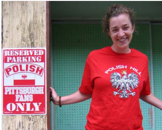
Everybody needs a Polish Hill T-shirt. Available in red and black, children's and adult sizes. $12 each