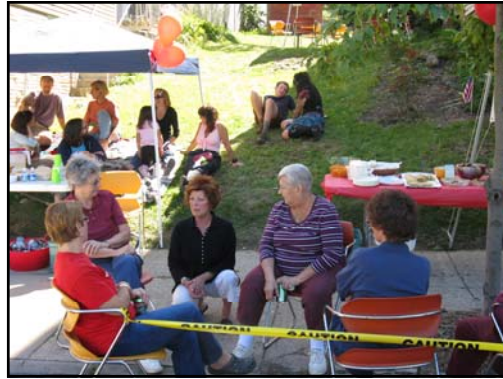
Members of the IHM Rosary Society and others had a chance to visit and talk during the party.

On September 19, a beautiful sunny Saturday, the PHCA celebrated its 40 th anniversary with a potluck cookout. Residents sat on the sidewalk, visiting in the sunshine, and sprawled under canopies in the PHCA side yard.