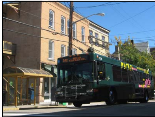
The 54C at the intersection of Brereton and Dobson streets.

As some of you may be aware, the Port Authority of Allegheny County is concluding a multi-year Transit Development Plan to comprehensively evaluate their entire transit system, simplifying bus routes and improving overall service while attempting to keep system costs in check. As a part of this process, Port Authority and its consulting firm looked into each route in-depth, evaluating ridership trends, schedules, costs, and overall role in the system. Released in December 2008, the 54C's route evaluation noted its unique role as an effective cross-town route, its high number of route variations, and its lower-than-average operating cost. Recommendations for