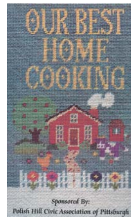
From our home to yours—Polish Hill's best home cooking.