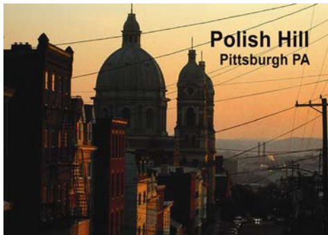
Beautiful sunset view of the neighborhood.