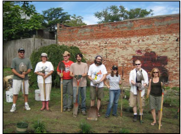
Members of the Polish Hill green team spent a day in late August putting in new plantings at the lot on Dobson and Herron, now called Mały Park.

Bolstered by The Mayor's office, the City of