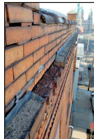
Bill Dell, and details of the masonry renovations on the building.