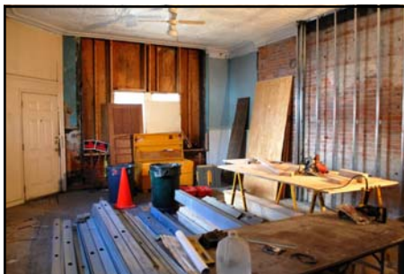
On the first floor, in the future coffee shop space.

Demolition of the interior is complete, and framing is just about finished. You can really get a feeling of what the place will be like. The upstairs spaces are coming along as well. Electric panel boxes are in place, bathrooms are framed, and the ceiling joists are exposed. The exposed ceiling joists will be part of the finished decor.